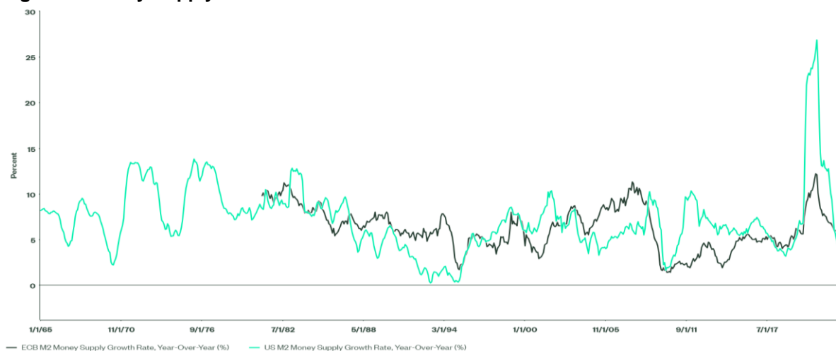
Figure 1: Money Supply

Data as of 25 April 2023.