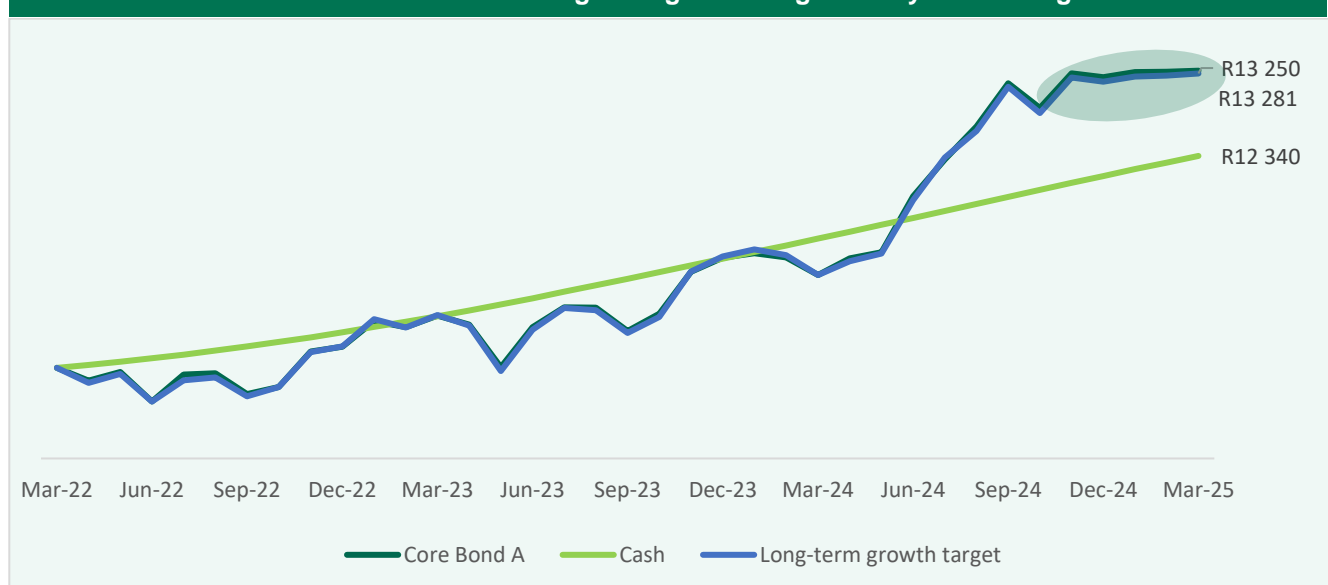
Fund Return versus Cash 1 and the Long-term growth target for 3 years ending 31 March 2025

Over most periods, the Nedgroup Investments Core Bond Fund has done significantly better than bank deposits (cash) as the Fund benefited from the yield enhancement from investing in longer dated bond instruments. Over the past ten years it has delivered more than 2.4% of additional return per annum, or R4 657 for every R10 000 invested.